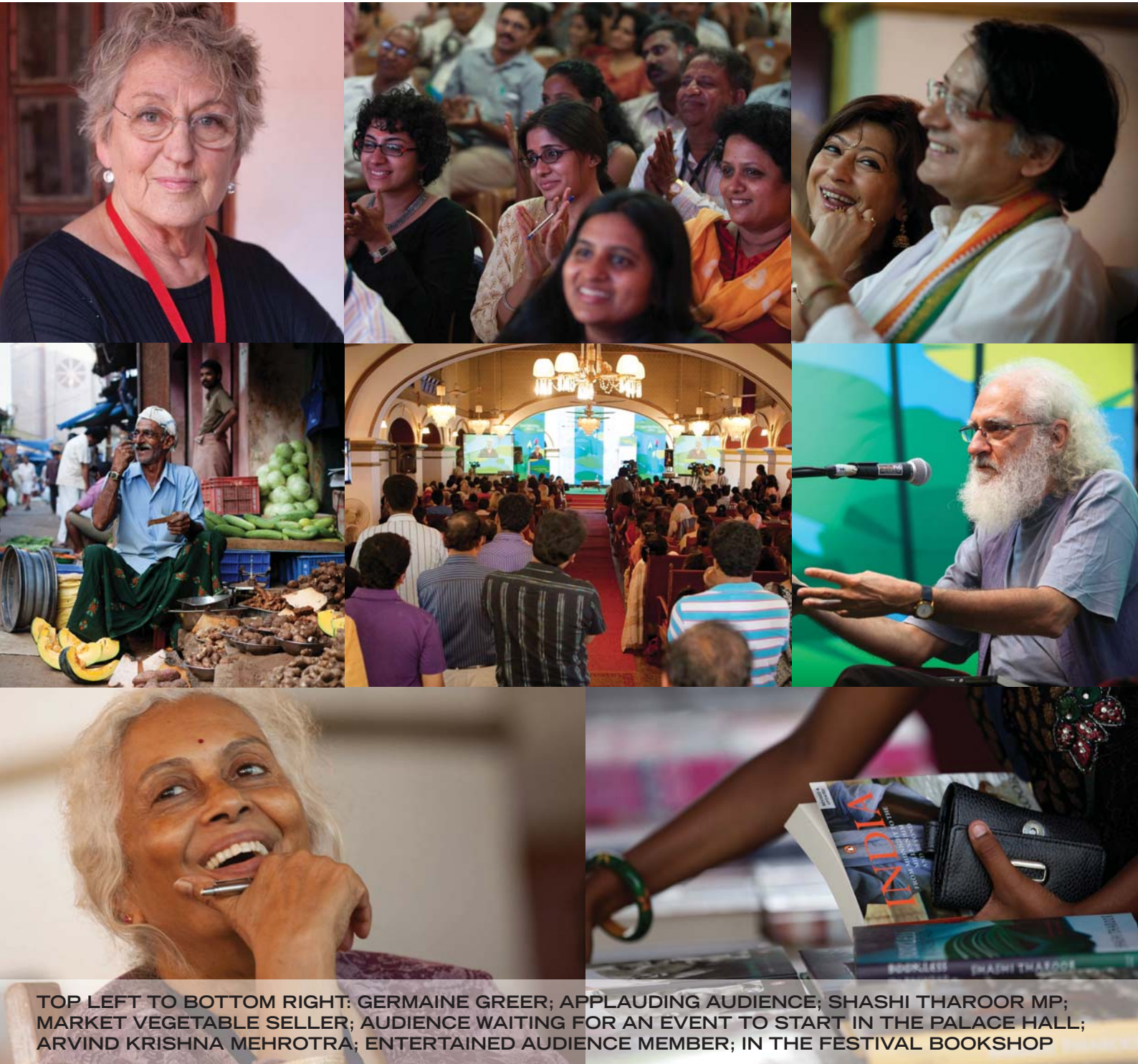
TOP LEFT TO BOTTOM RIGHT: GERMAINE GREER; APPLAUDING AUDIENCE; SHASHI THAROOR MP; MARKET VEGETABLE SELLER; AUDIENCE WAITING FOR AN EVENT TO START IN THE PALACE HALL; ARVIND KRISHNA MEHROTRA; ENTERTAINED AUDIENCE MEMBER; IN THE FESTIVAL BOOKSHOP