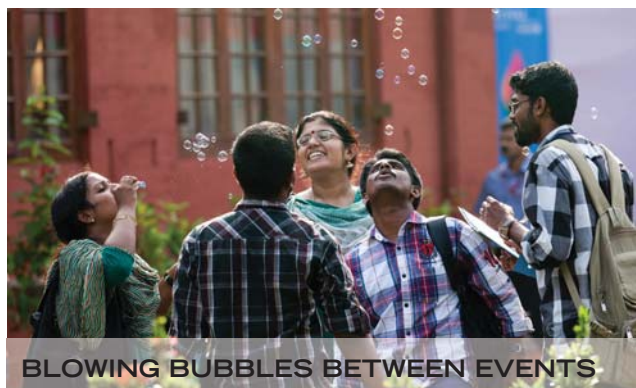
BLOWING BUBBLES BETWEEN EVENTS