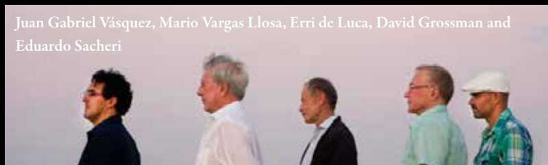
Juan Gabriel Vásquez, Mario Vargas Llosa, Erri de Luca, David Grossman and Eduardo Sacheri