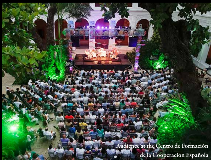
Audience at the Centro de Formación de la Cooperación Española